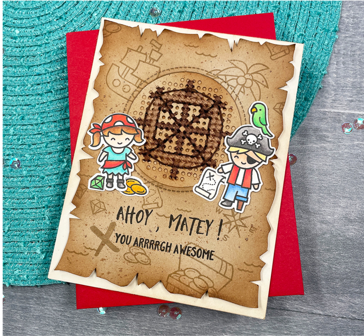
created for lawn fawn by chari moss

Pattern for Embroidery Hoop Lawn Cuts by Chari Moss