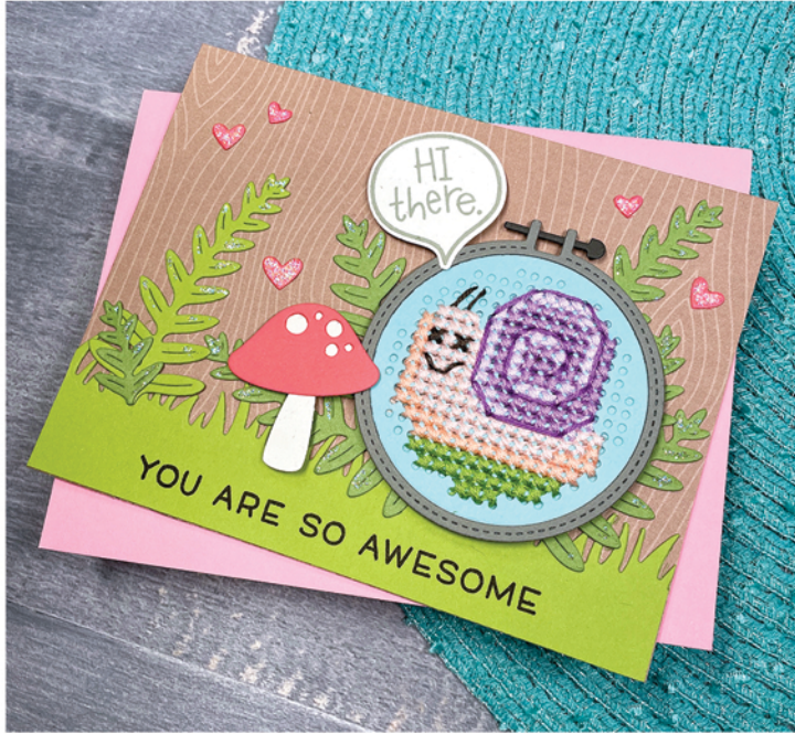
created for lawn fawn by chari moss

Pattern for Embroidery Hoop Lawn Cuts by Chari Moss