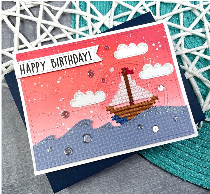
created for lawn fawn by chari moss

Pattern for Embroidery Hoop Lawn Cuts by Chari Moss