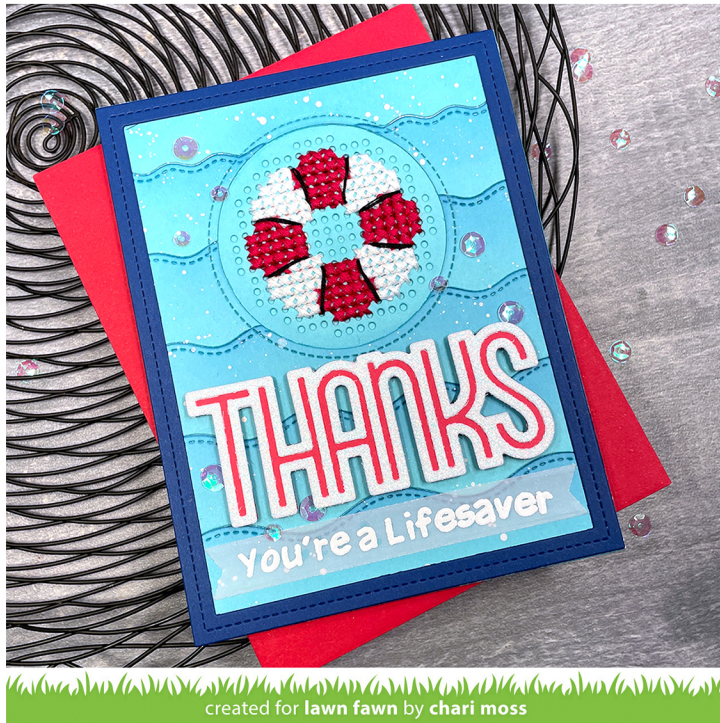
created for lawn fawn by chari moss