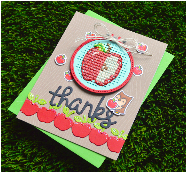
created for lawn fawn by chari moss