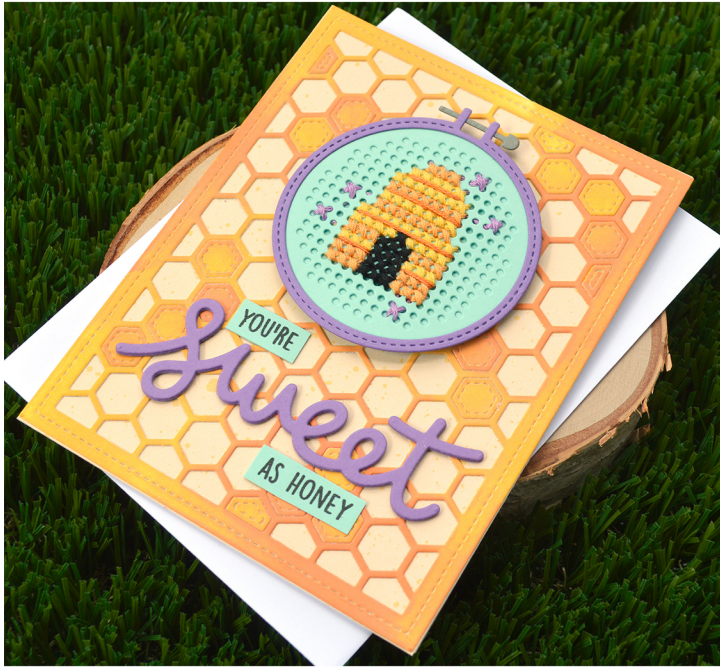
created for lawn fawn by chari moss