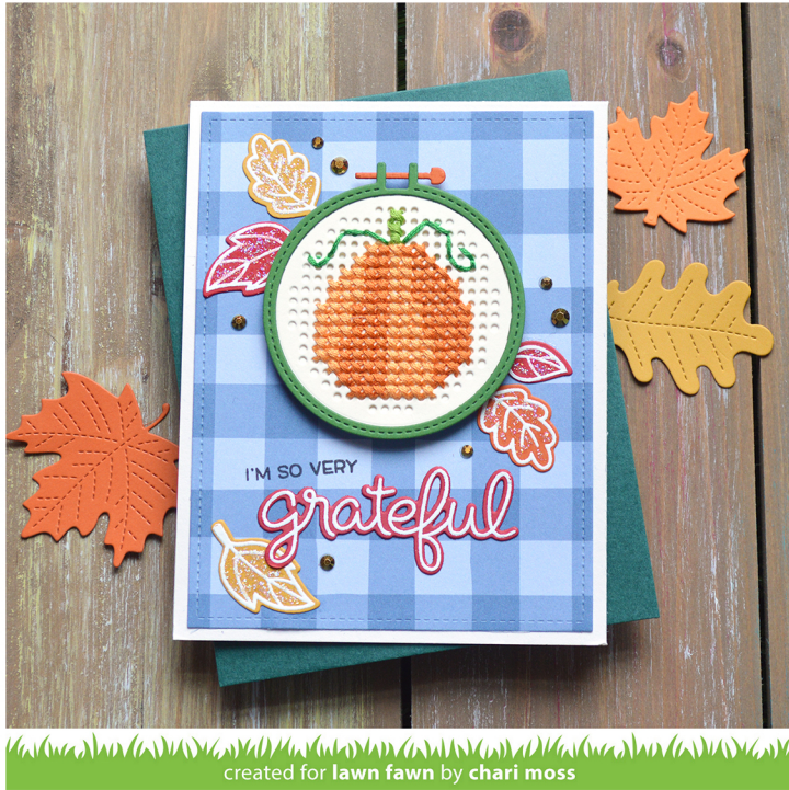
created for lawn fawn by chari moss

Pattern for Embroidery Hoop Lawn Cuts by Chari Moss